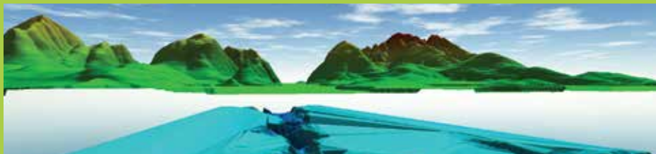
Display of multiple surfaces in the 3D View

Global Mapper's powerful 3D Viewer allows any 3D data, including LiDAR point clouds, digital elevation models, and 3D vector features to be rendered in stunning 3D. This customizable oblique view offers a truly realistic perspective within either a full-screen view or docked side-by-side with the corresponding 2D map. Capture the 3D view as an image file or as a fly-through video recording.